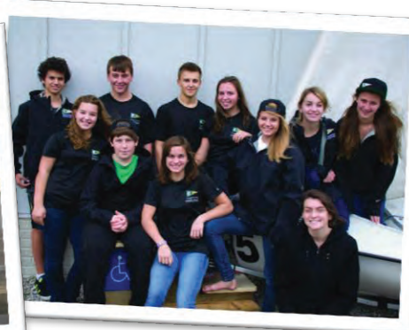
TC West Team