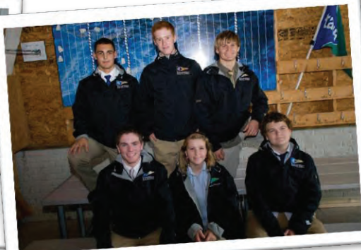
TC St. Francis Team