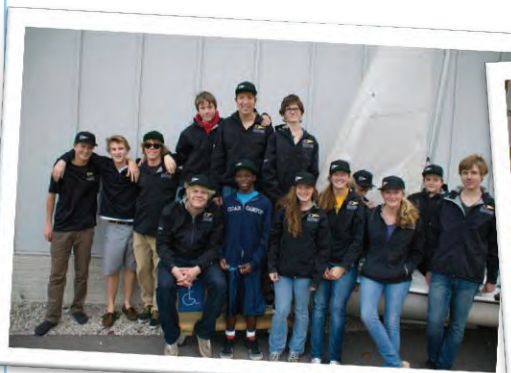
TC Central Team